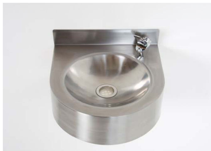
The Veitch Wall Mounted Drinking Fountain comes complete with sturdy bubbler and PVC waste outlet. It features a 65mm upstand to rear and one-piece construction for cleanliness.

The Veitch Wall Mounted Drinking Fountain is fully recyclable and is 100% Australian made.