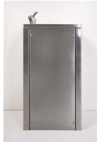
The Veitch Squareline drinking fountain comes complete with sturdy bubbler and PVC waste.