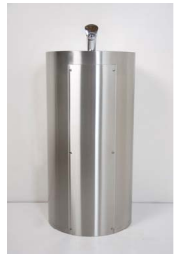
The Veitch Rondo drinking fountain comes complete with sturdy bubbler and PVC waste.