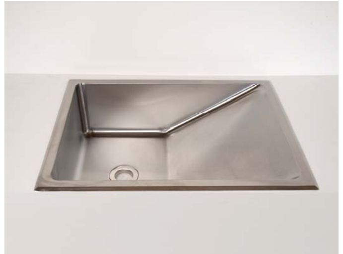
The Veitch Baby Bath is an insert model that is set into a bench. It features one-piece construction for cleanliness and minimum maintenance.

The Veitch Baby Bath is manufactured entirely from 1.2mm Grade 304 stainless steel in a complete one-piece construction for cleanliness and minimal maintenance, is 100% Australian made and is fully recyclable.